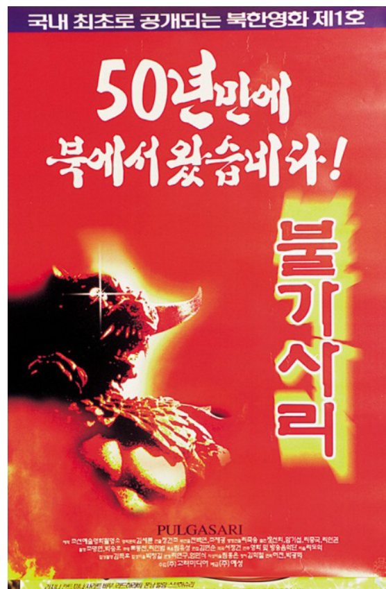
Figure 3. Poster of the film Bulgasari for its release in South Korea (2000)

are forced to have, confronted with the emergence of this bizarre monster coming-out-of-nowhere: What is this weird creature? Is it good or bad? Are you with us, or against us? Thus, the film from the beginning links the grassroots people's existential condition and their "recognition" of the "existence" of the monster.