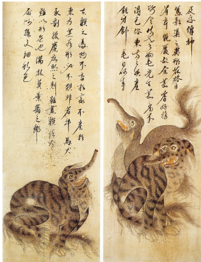
Figure 1. Kim Du-Ryang's drawing of Bulgasari on Folding Screen.

riots, insurrections, mutinies and other forms of antisocial action are defined as monstrosity by the ruling powers and, on the contrary, collective violence to quell such “monstrous” actions is justified as a rational and “humanistic” effort to maintain social normalization and the status quo.