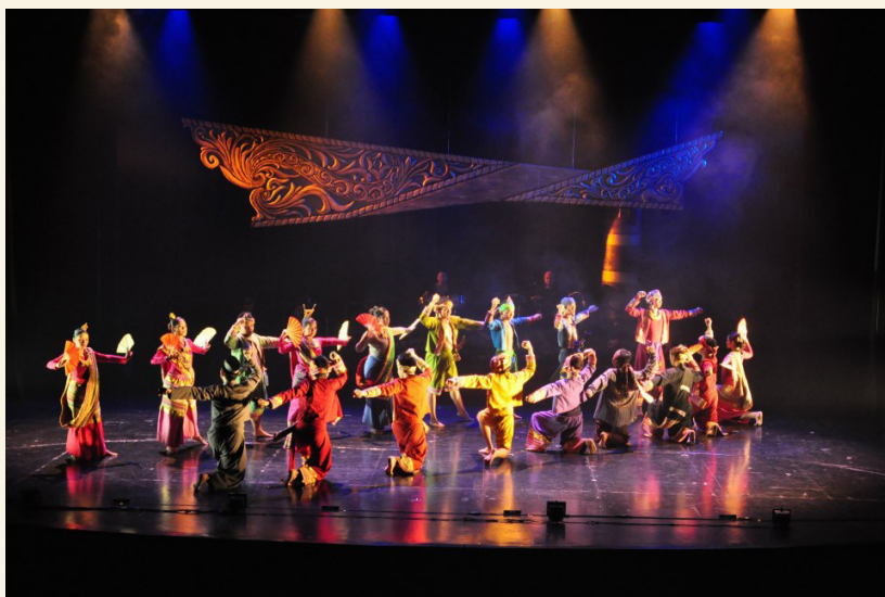
Prologue: The players enter to dance the igal , as well as present the theatrical and narrative context of the production.