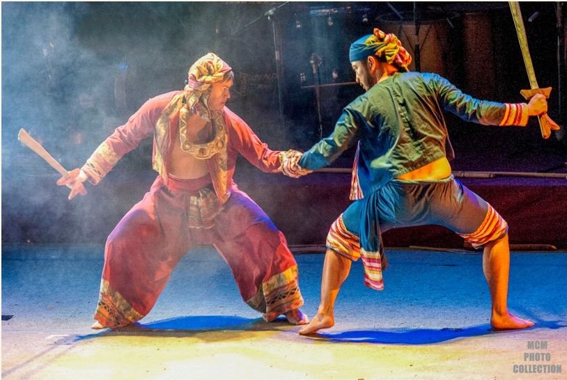
After his secret wedding with Jamila, Rashiddin sees his friend Badawi in a fight with Taupan of the Kalimuddins and gets entangled with the law.