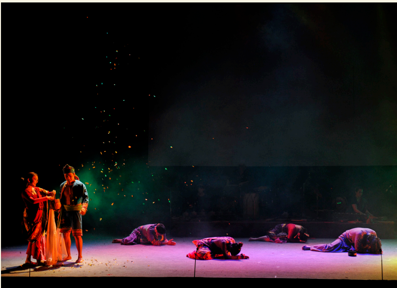
In the epilogue, Rashiddin and Jamila reunite in the afterlife amid the swirls of butterflies.