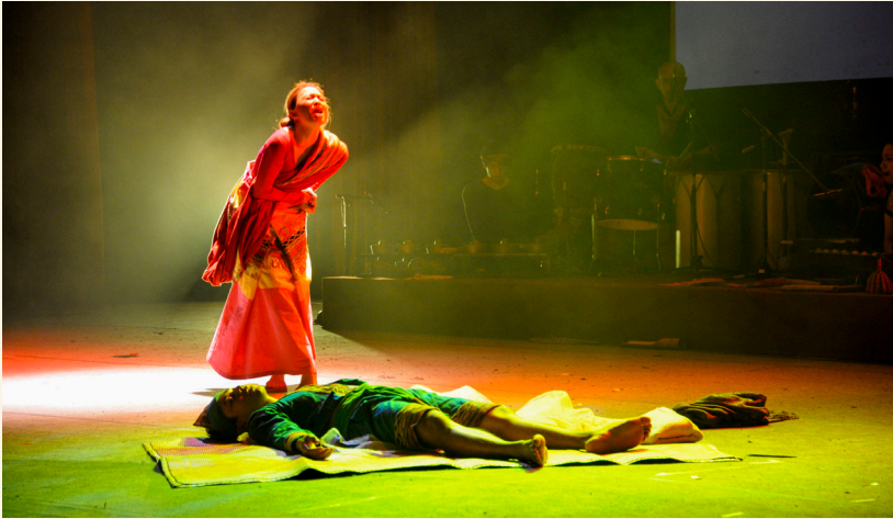
Jamila awakens and, unable to save Rashiddin from the poison he has taken, stabs herself to death.