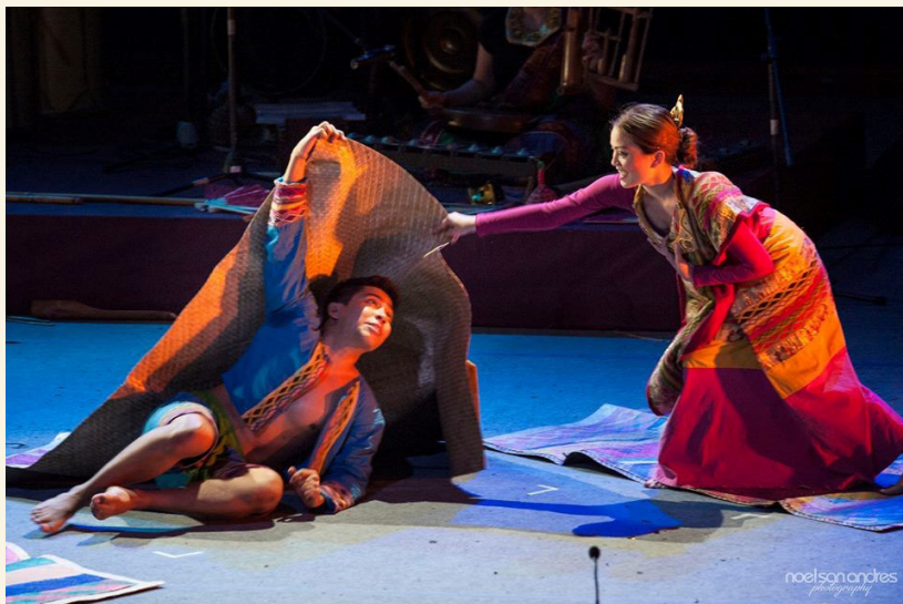
Smitten after meeting her in a masquerade ball, Rashiddin pays Jamila an unexpected visit at her balcony.