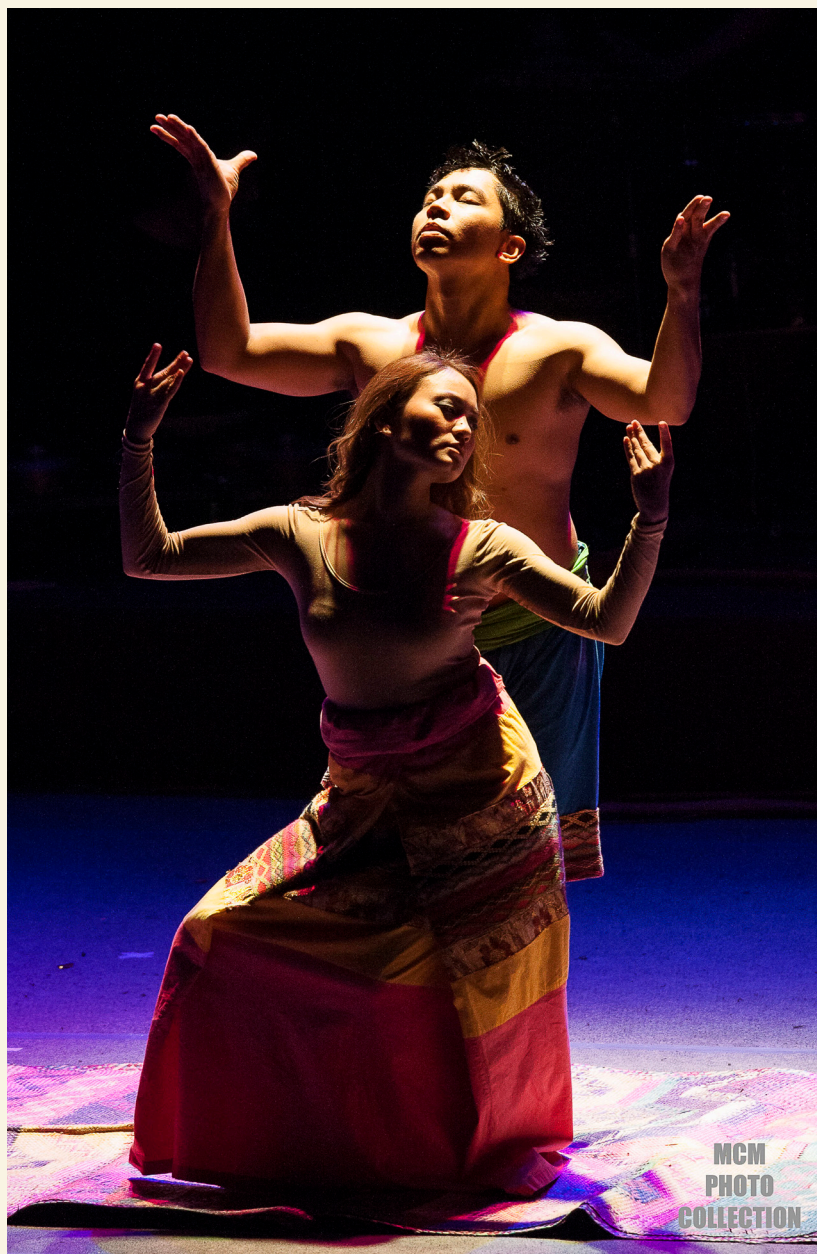
Though exiled, Rashiddin secretly meets his new bride to celebrate their wedding night.