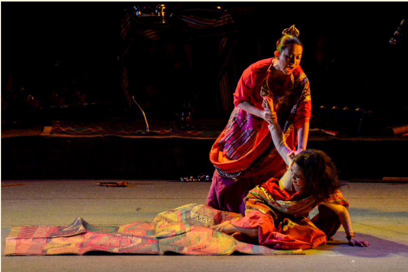
Gng. Kalimuddin threatens the stubborn Jamila for refusing to marry Datu Pian-dao.